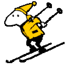
Table Tennis Swimming Zumba Classes Skiing